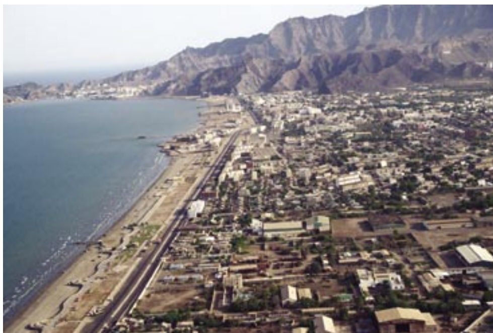
Yahya Mohammed Al-Showaibi

Aden is a port of major historical significance on the Red Sea. Its position at the tip of the Arabian Peninsula near the entrance to the