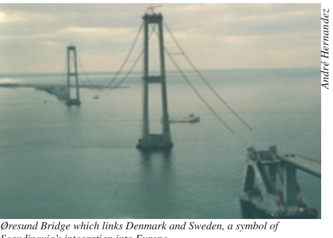
Scandinavia's integration into Europe.

There is only one administrative level after central government, the commune, which has extended powers and is in direct contact with the public. Taxes are paid to the commune of residence which provides social cover, and not to central government. There is only one centrally-run local level, the District, with few prerogatives such as regional planning, but the commune can refuse to apply a proposed plan. Copenhagen, the only large city, includes 10-30 communes depending on how far out the city limits are drawn. There is no ad-