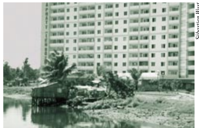
A squatter settlement in Hô Chi Minh City, Vietnam

Our findings show that the effects of these two forms or forced rehousing (large-scale operations and micro-projects) converge, with both generating very similar socioeconomic mechanisms, albeit with differing intensities. Examples are family debt, the reselling of dwell-