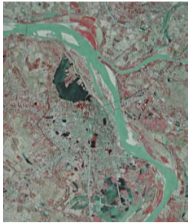
Spot Image, 2000