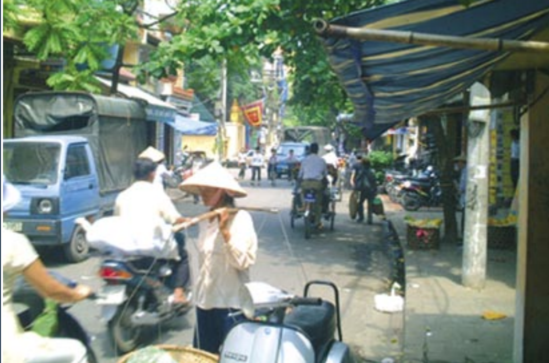
A street scene in Ma May, one of the streets in the Hanoi shopping district known as the 36 Streets