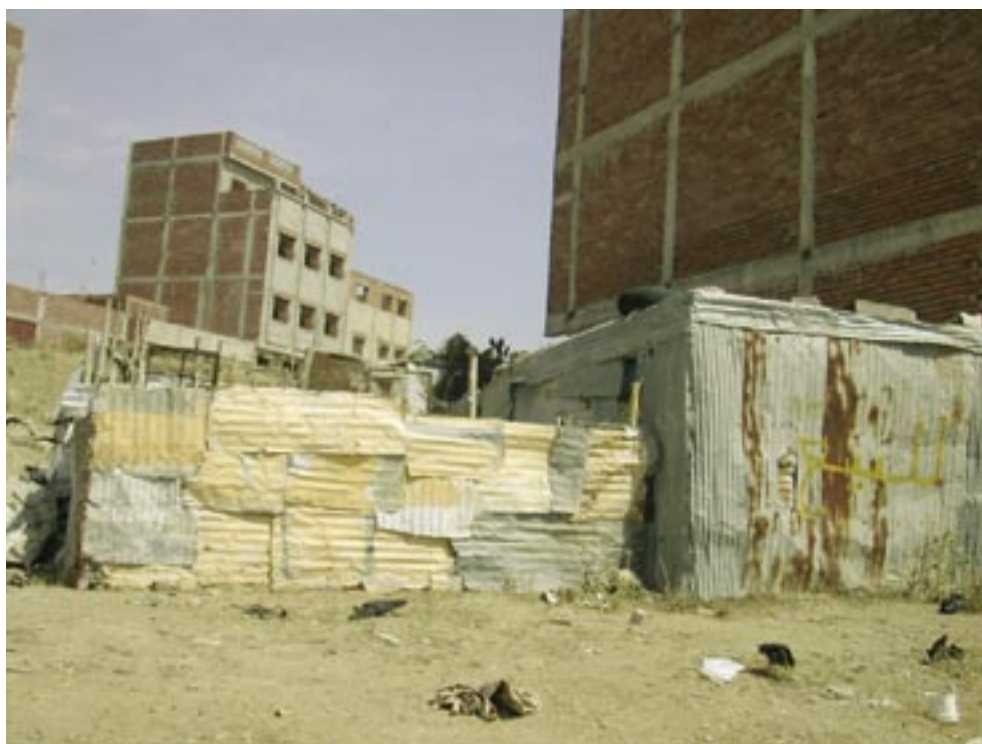
Rehousing in the Kheir district: on-going construction work and shacks for sale in Tangiers (Morocco).

In this research we have attempted to avoid the reductionism which results from analysis of urban policies and projects that focuses solely on institutional actors and fails to ascribe an active role to inhabitants and local actors. The research was conducted in four countries which differ as regards urbanization and public policies, but which are all characterized by an "authoritarian" style of government. It places these countries in a context in which major urban issues and the processes of land reclamation and/or the upgrading of urban centres which stem from them are becoming internationalized. It analyzes the interactions between institutional policies and social dynam-