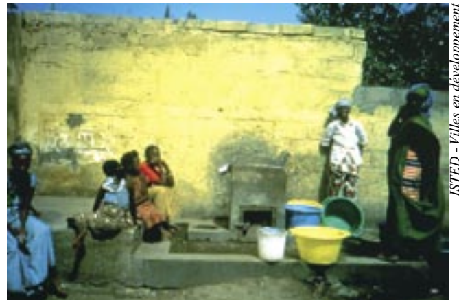
A public fountain in Pikine, Senegal.