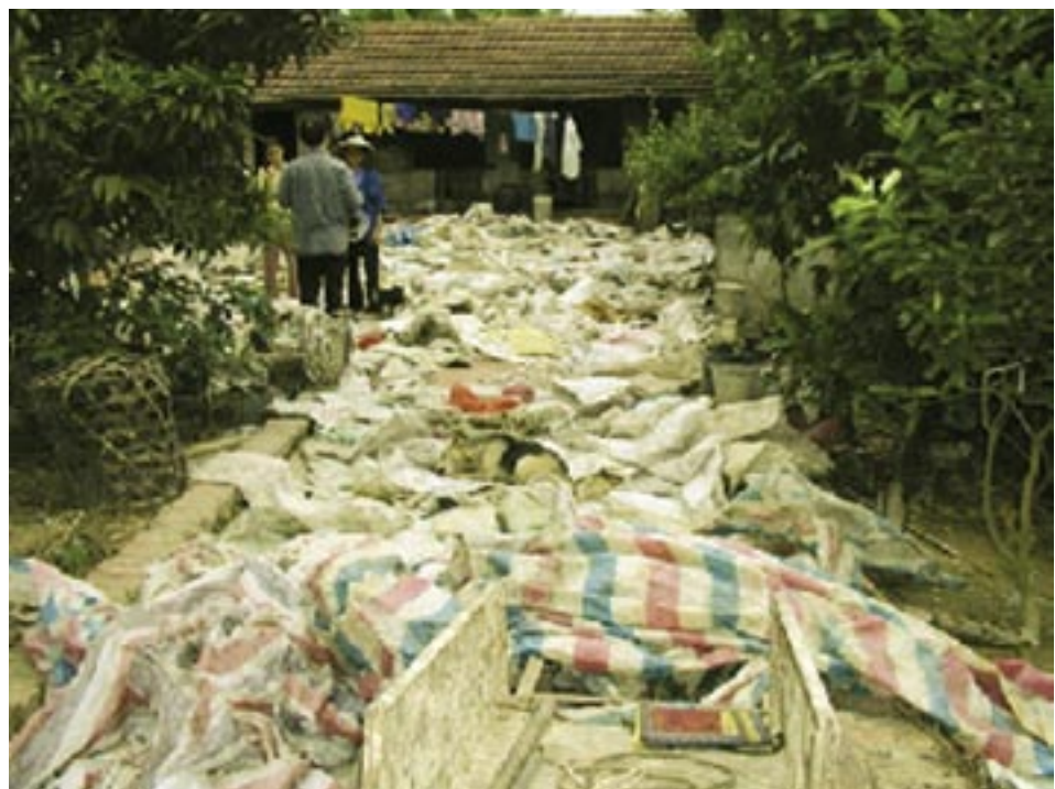
Recycling waste in Nam Son, Hanoi

This research leads to the conclusion that a public space does exist in Vietnam