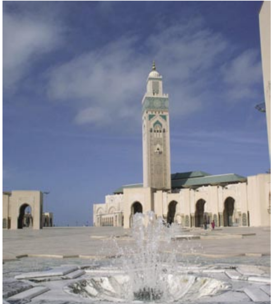
The Hassan II Mosque in Casablanca

ban water governance in Morocco and Vietnam cast on the central issue of the regulation of these systems? This constantly recurring question suggests not so much a choice between the “private” and “public” sectors as mixed institutional procedures that are capable of avoiding monopolistic tendencies in water distribution. ■