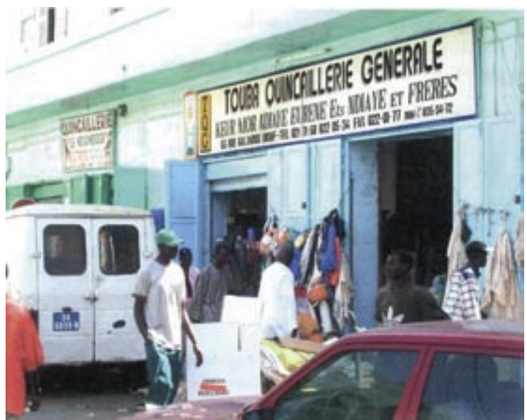
The presence of the brotherhood in places of trade: a marking out of territory

formal and traditional networks, combined with formation of partnerships with formal urban management