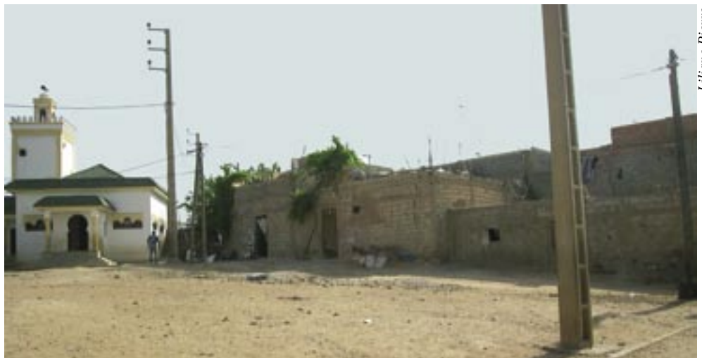
District in the process of regularization in Tiflet, Morocco

The reduction in the number of local urban planning technicians and their competition, the instability of action frameworks, the appearance of the concept of project and new professional figures are tending to lead to the recomposition and complexification of local systems of actors which remain marked by the presence of central government and its departments. ■