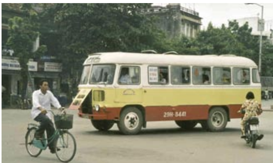
Bus and bicycle in Hanoi

variable and the market is largely dominated by public sector engineering services. In Cambodia, home-grown expertise in the form of en-