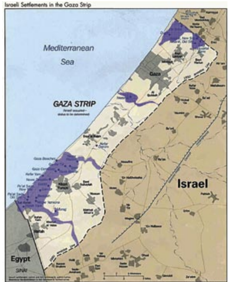
Ville et Habitat, Jean-Pierre Troche

The Gaza strip is a closed and fragmented territory as a result of the Israeli occupation: the areas controlled by Israeli colonists and the “security corridors” are shown in blue. No network that serves Palestinian areas is allowed to cross these areas.