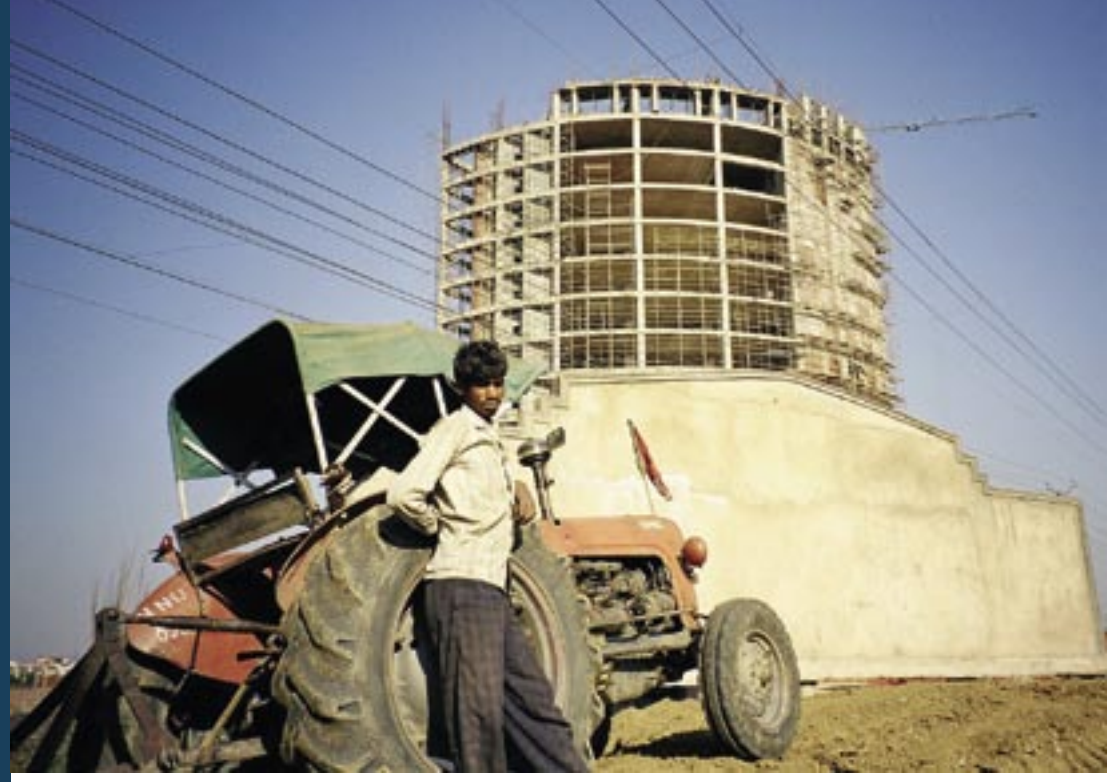
Building a new town to the south of Delhi