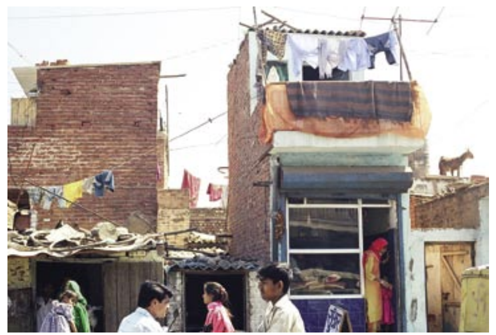
A slum in a southern district of Delhi: consolidation and densification of a spontaneous settlement on squatter land with no drainage network and illegal electrical connections.

In order to promote the development of urban infrastructure and better respond to housing demand, at the end of the 1980s, the Indian Government adopted a new urban strategy centred around decentralization, deregulation and public-private partnerships. A constitutional amendment promulgated in 1992 awarded greater autonomy to municipalities with regard to implementing their own planning policies and seeking private funding. The repeal of the Urban Land Ceiling Act in 1999 aimed to stimulate the land market. Various urban programmes, funded by central government, target development in certain categories of cities (small and medium-sized