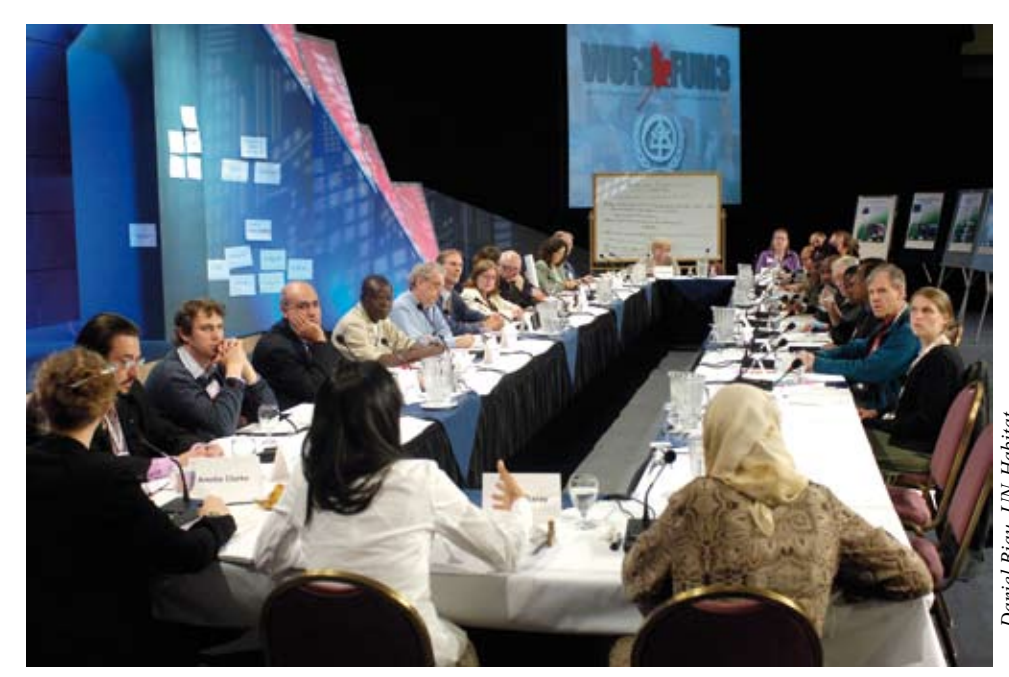
WUF urban forum, Vancouver, 2006.

Perhaps the fundamental discussion in Vancouver was about the future of cities. Several UN-Habitat reports clearly show that urban development presents both risks and opportunities. But in many conurbations in the South and the North, the negative aspects, of a social nature (inequalities, poverty and insecurity) and an environmental nature (pollution) outweigh the positive aspects, which are essentially