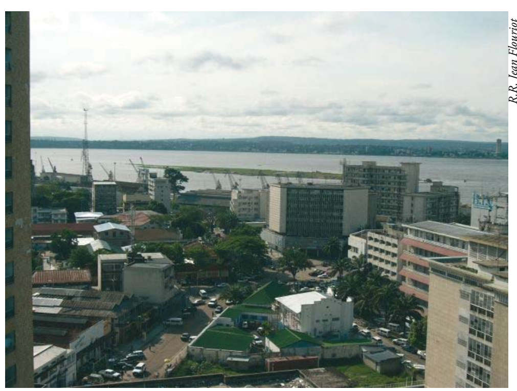
Kinshasa port aera.

The 100 km of new roads, which have been planned for the last thirty years, would only represent an investment of 100 million dollars. An ongoing World Bank