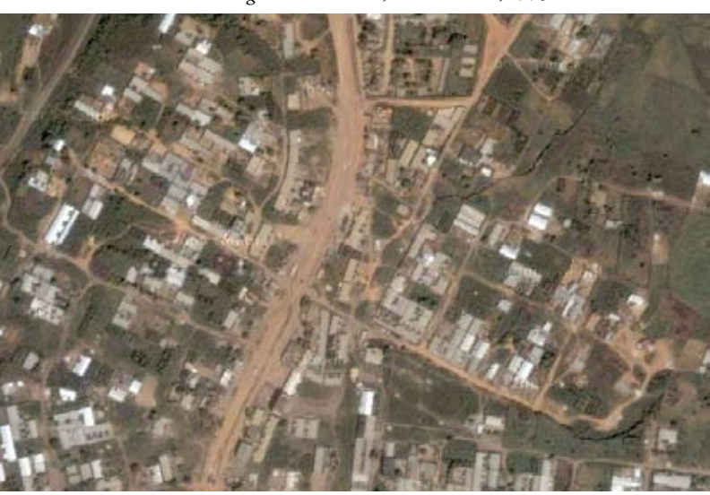
Apartment Blocks in Cocody, Côte d'Ivoire, 1970.

by-side with the modern economy, a sector of activities known as informal, because it was unregulated, was developing. Michael Lipton blamed this on an "Urban Bias": the population was drawn into cities because of the advantages given to city dwellers at the expense of the rural population. This idea led to a review of aid: efforts were focussed on rural areas, slowing urban growth and providing essential services to the citizens while demanding that they pay their cost. In fact, migration into Abidjan only slowed as a result of the economic crisis. The speed with which this occurred shows that the migration had a rational basis, i.e. the opportunities for earning in the informal sector.